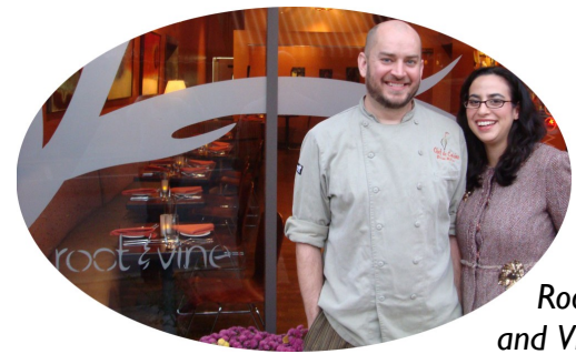
Root and Vine